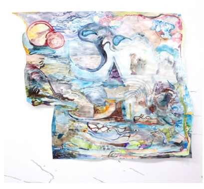
<u>Ebb, Flow</u>, 2020 Alternate Currents Working Group Exhibition